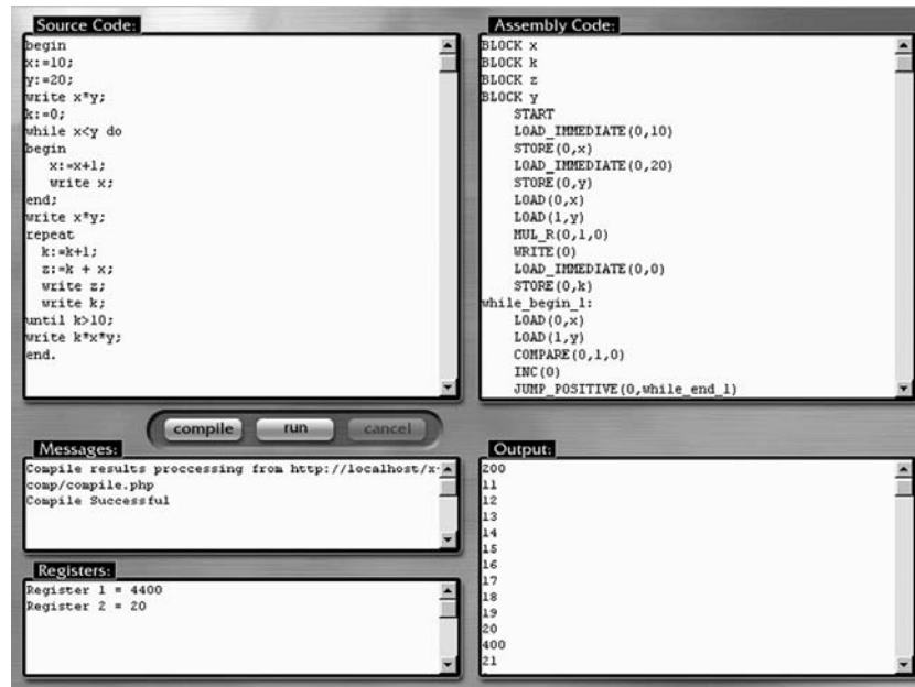
Figure 1. The WIPE Compiler programming environment.

Move & Store instructions (LOAD, LOAD_IMMEDIATE, STORE, MOV_R) Compare instructions (COMPARE) Arithmetic instructions (ADD_R, SUB_R, MUL_R, DIV_R, INC, DEC, NEG) Jump Instructions (JUMP, JUMP_POSITIVE, JUMP_NEGATIVE, JUMP_ZERO) Input/Output Instructions (READ, WRITE)