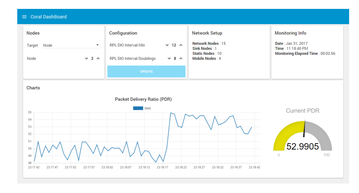
Fig. 2. The CORAL dashboard shows the impact of the dynamic RPL configuration in real-time

responsible for the setup, configuration, data collection and investigation of the experiment in real time. In order to communicate with the lower modules it uses the WiSHFUL software platform (https://github.com/wishful-project).