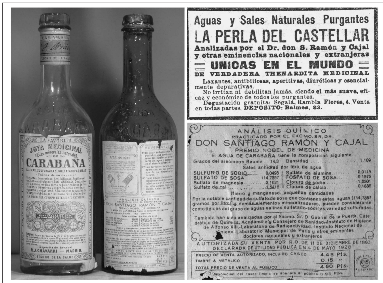
Figure 4. Left: Two bottles of Carabaña company's La Favorita mineral water from the outskirts of Madrid. The reverse bottle label on the right shows Cajal's chemical analysis. Salt residue still exists at the bottom of the bottle's inside [ca. 1928]. A detail of the label with Cajal's name can be seen at the lower right figure; the flat image of the label was obtained by rotating the bottle manually on the scanner glass surface, while the light drum was advancing. Upper right: An advertisement for Perla del Castellar water approved by Cajal, appearing in Barcelona's newspaper La Vanguardia (Thursday, August 22, 1907, p. 9; also appearing on Sunday, August 25, 1907, p. 11; bottles and documents from the authors' private collection).

water was distributed in carafes to nearby places and was used to treat various ailments.