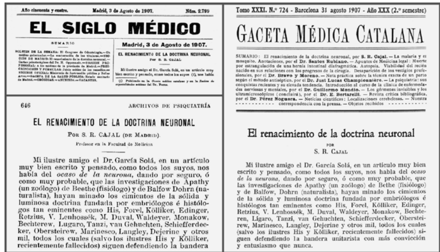
Figure 2. Title page of three variants of Cajal's 1907 'Renaissance' article [2,3,5].

Two years later, Waldeyer [23] firmly supported Cajal's neuronismo and combined the objective evidence that had been adduced by His, Forel, Gowers, Kölliker, Retzius, van Gehuchten, von Lenhossék, Nansen, Cajal, as well as his brother Pedro Ramón y Cajal [24]. Waldeyer came up with the term neuron — a word first appearing in Homer's Iliad [25] — to denote what was, until then, called the 'ganglion cell' or 'nerve cell' and systematized the 'neuron doctrine' [1,26–32]. According to the neuron doctrine (Figure 3), or neuron theory today, nerve cells are viewed as polarized structures, contacting each other at specialized synaptic junctions, and forming the developmental,