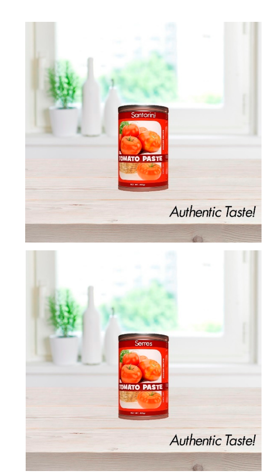
Figure 2. Stimulus Materials.