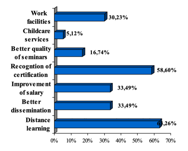
Figure 1 - Percentages of learners' responses for participation facilitators to training.